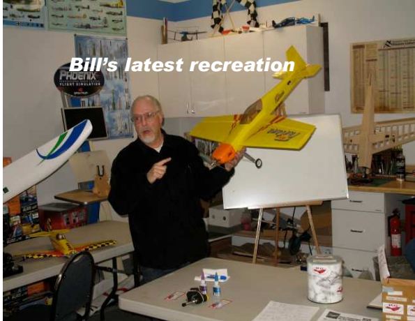
Bill's latest recreation