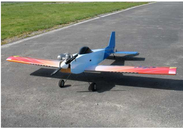
Del has these birds ready to fly. Despite the wind being a little tricky !