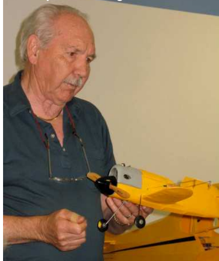
Bill's beautiful control liner ready for trial flight.