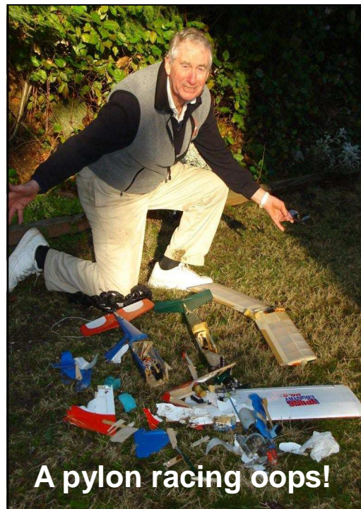
A pylon racing oops!