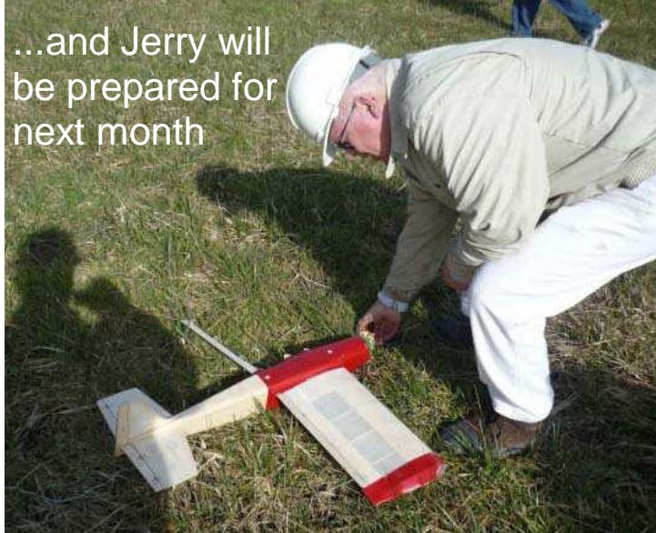
...and Jerry will be prepared for next month