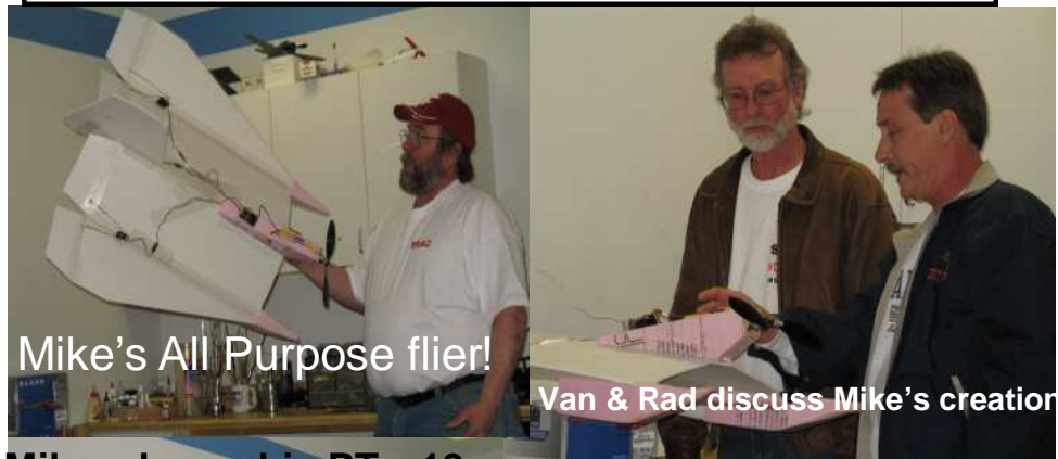
Mike's All Purpose flier!