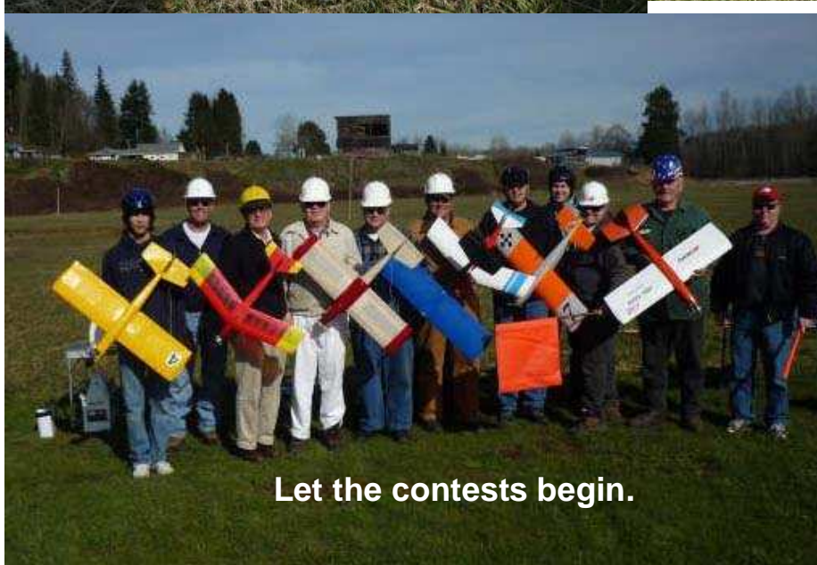
Let the contests begin.