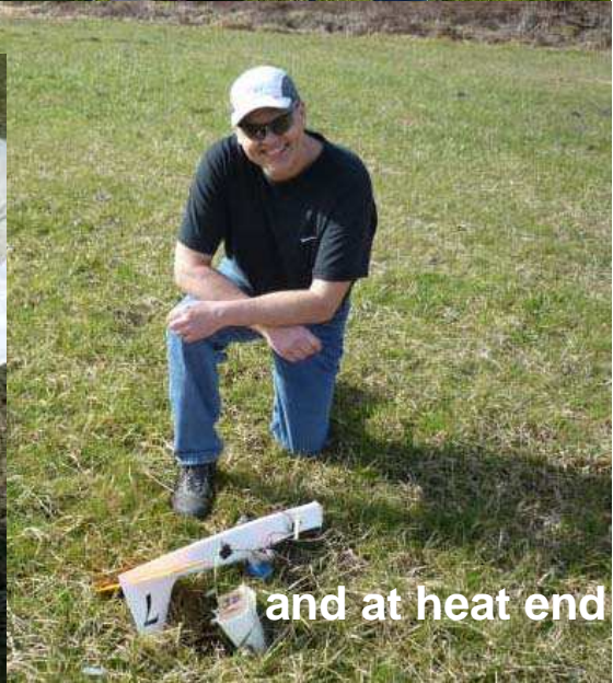
and at heat end