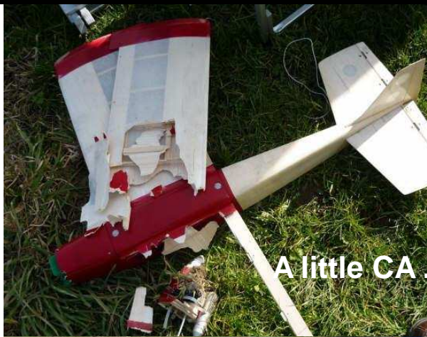
A little CA ...