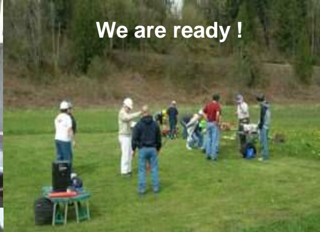
We are ready !