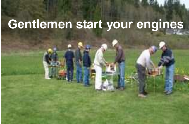
Gentlemen start your engines