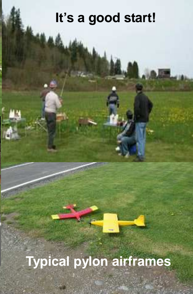
It's a good start!