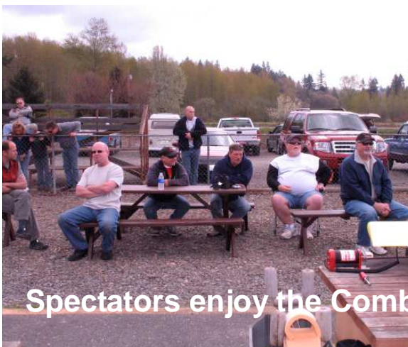
Spectators enjoy the Combat

Combat Season Opener April 26th was a resounding success. The spectator class was exceptionally well represented.