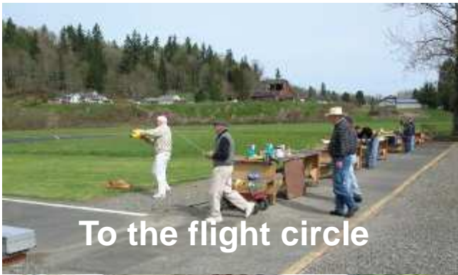
To the flight circle