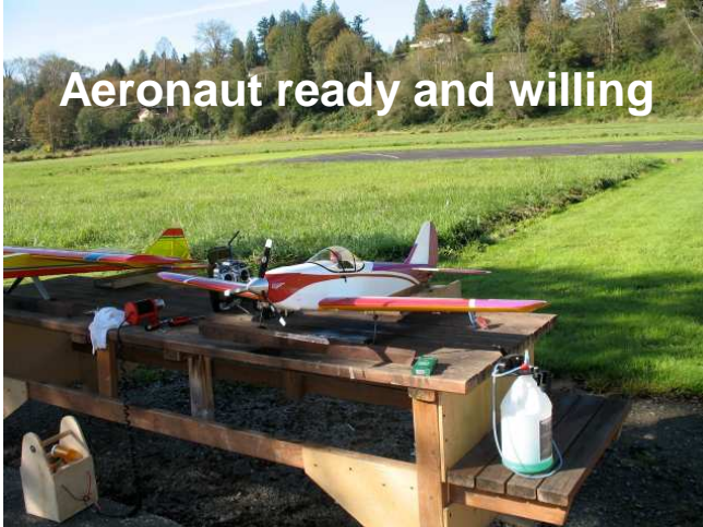
Aeronaut ready and willing