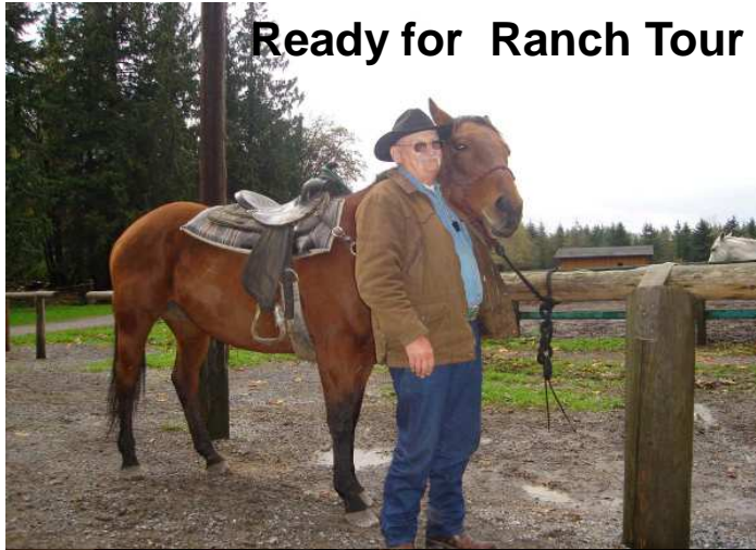
Ready for Ranch Tour