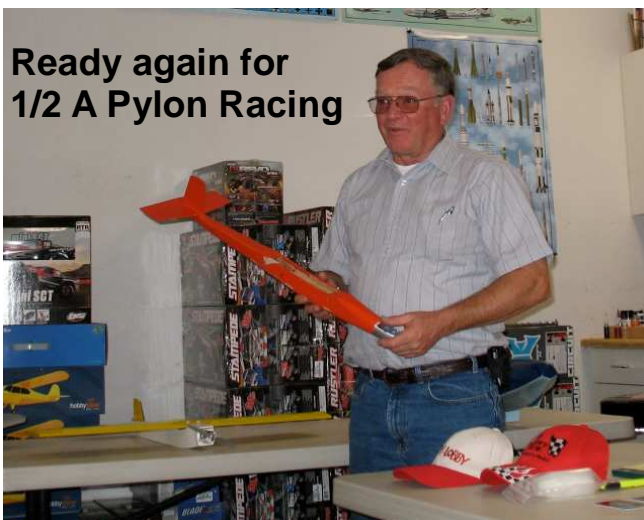
Ready again for 1/2 A Pylon Racing