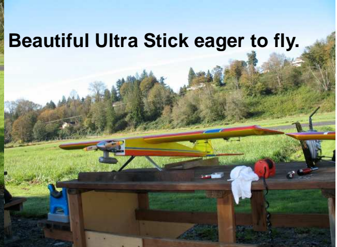
Beautiful Ultra Stick eager to fly.