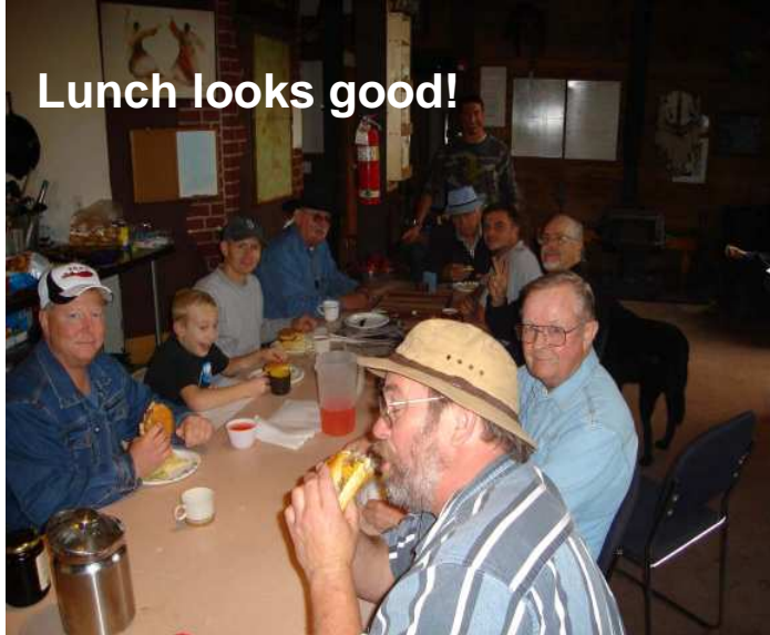
Lunch looks good!