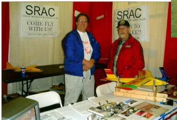
SRAC At Hobby Show