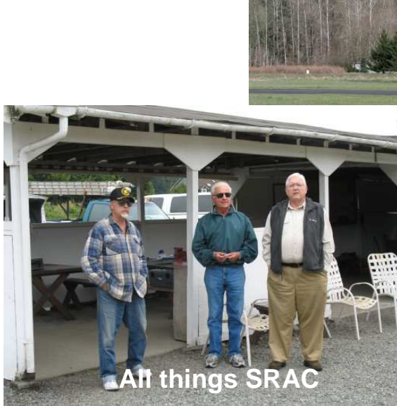
All things SRAC