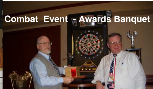
Combat Event - Awards Banquet