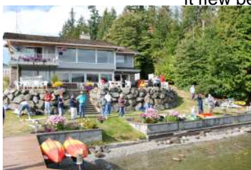
Everyone enjoyed this event.