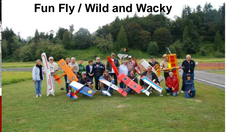
Fun Fly / Wild and Wacky