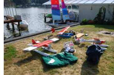
Planes ready for the water