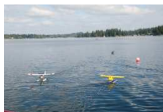
Before and after a successful flight