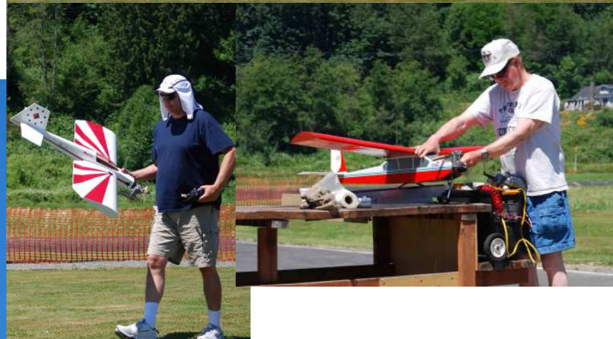
Eager participants—great contestants