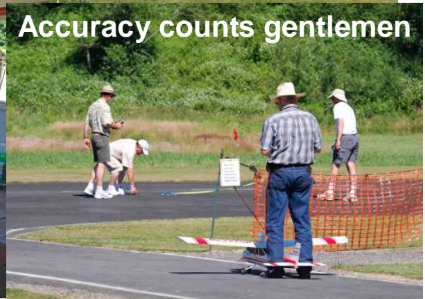
Accuracy counts gentlemen