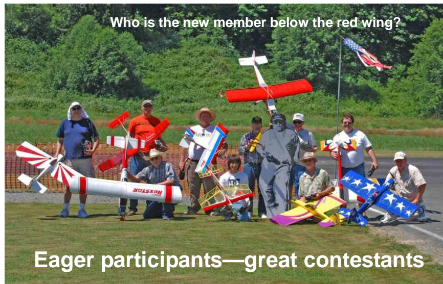
Who is the new member below the red wing?