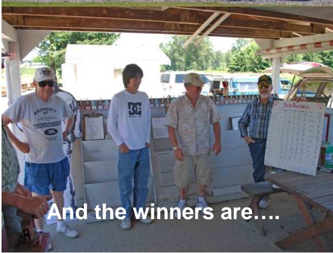
And the winners are....